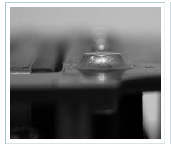
Figure 3 (right) Maxi / Mini output power pin and Sense pin